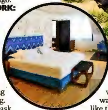
Vik Retreats (2)

MUST TRY: Jose Ignacio's hottest new restaurant, La Susana, is also owned by the Viks and, as luck would have it, is located right next door. The ceviche of the day is made with fish caught in the very waters you see out the window, the fried Atlantic calamari was vastly superior to any other we'd tried, and the Vikaccino "dessert" is a tweaked version of an