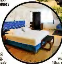
Vik Retreats (2)

A coffee maker in the room would allow for